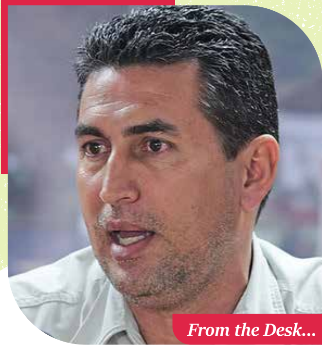
From the Desk...

Some emotions are so complex that it is almost impossible to explain them in words. Some nights when I try to sleep, as I toss and turn in bed, a wave of ideas and memories invade my thoughts; there you are, entangled in all of them, absent, but always so present.